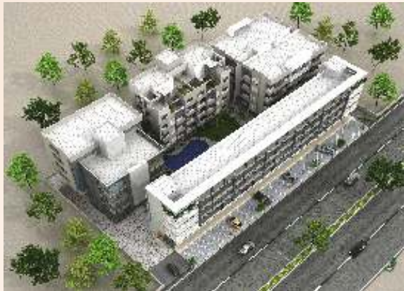
AKARSH-1 (SHOWROOMS | SHOPS | HALLS | OFFICES 3BHK FLATS) @ Gotri 30 mts. Road

Security: 24hrs gated security. Video phone with intercom facility.