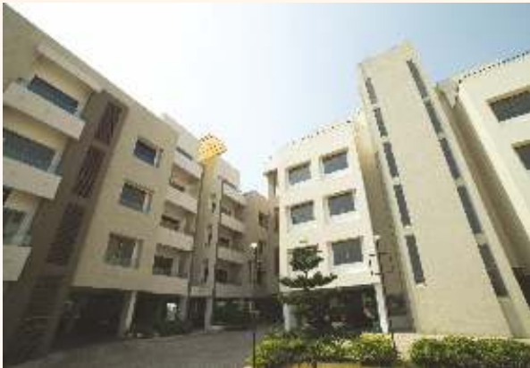
PRARAMBH (LUXURY FLATS) @ Gotri-Sevasi